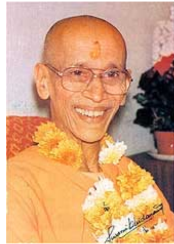
Sri Swami Chidananda